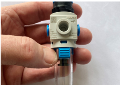
MS2 air regulator - pic 2

Compact, lightweight and with flows up to 350l/min, Festo's new MS2 air regulators and filters are compact enough to be installed directly on moving components in dynamic applications such as end-of-arm tooling